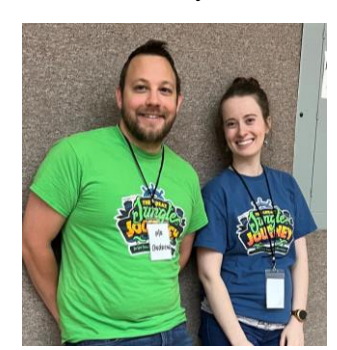
Helping at VBS

Components. Pray for us as we continue to complete our pre-field assignments.