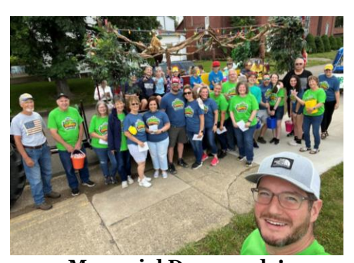
Memorial Day parade!

-On May 5th, we were blessed to present the Ghana ministry with our Ohio church family at Calvary Baptist Church of Coshocton. Near the end of May, we participated with the church in a Memorial Day Parade. We are very grateful for the year of ministry we've had with this local body of believers.