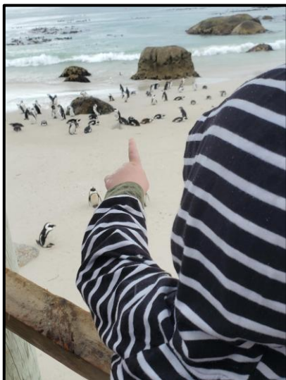
Kairos watching the penguins

Pray for us, we are in need of a vehicle for our time stateside! We are praying for a compact SUV or a minivan. We look forward to getting back and seeing some of you all again!