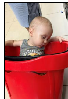
Shopping day is exhausting!